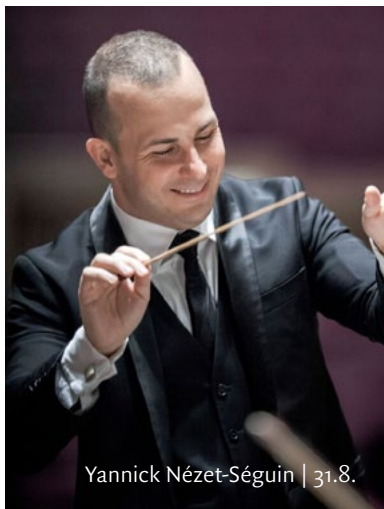
Yannick Nézet-Séguin | 31.8.