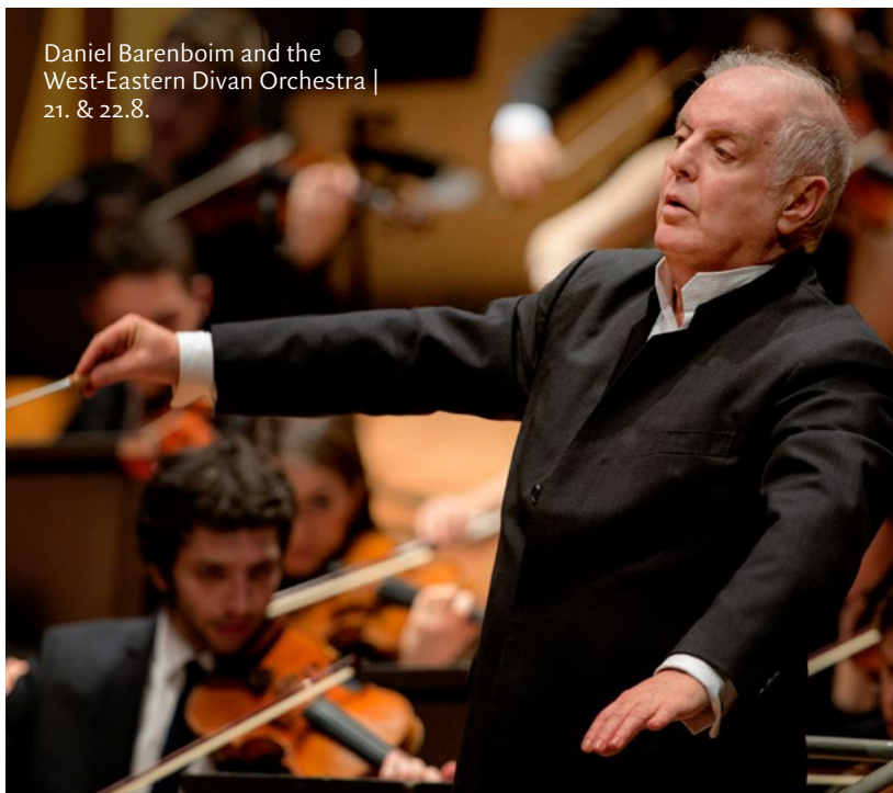
Daniel Barenboim and the West-Eastern Divan Orchestra | 21. & 22.8.

Ticket prices CHF 120/100/80/70/50/30 Seating map 5, p. 25 Event 18309