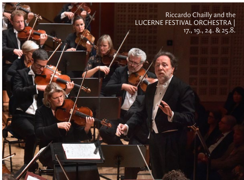
Riccardo Chailly and the LUCERNE FESTIVAL ORCHESTRA | 17., 19., 24. & 25.8.