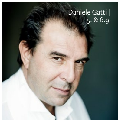
Daniele Gatti | 5. & 6.9.