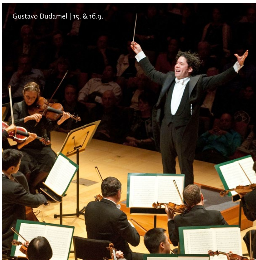
Gustavo Dudamel | 15. & 16.g.