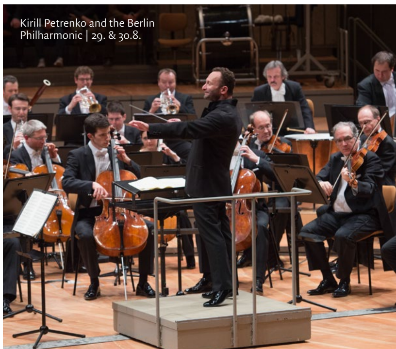
Kirill Petrenko and the Berlin Philharmonic | 29. & 30.8.