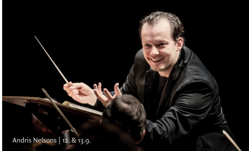
Andris Nelsons | 12. & 13.9.

Cosmos Stockhausen 6 18.30 | KKL Luzern, Lucerne Hall